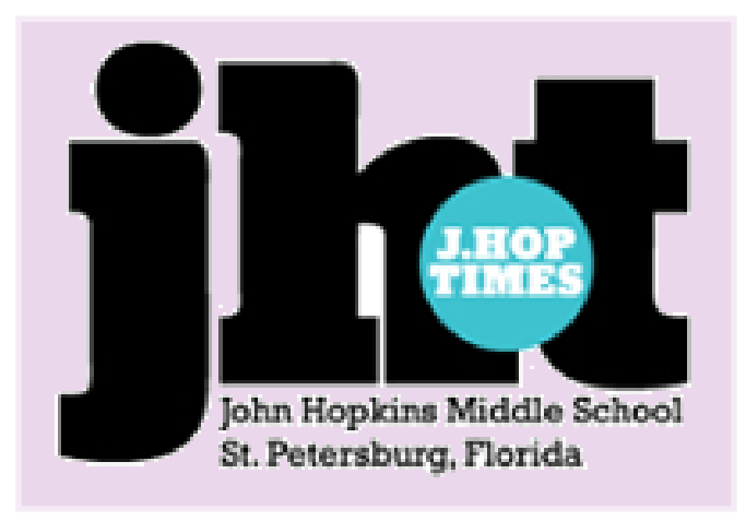
Click for Link to Journalism Site

Parents and other friends of John Hopkins, our awardwinning multimedia magnet program stays on top of what is going on around campus and the community. Keep informed by visiting the JHop Times website <u>www.pcsb.org/</u> <u>jhoptimes</u> or clicking on the newspaper link from the school